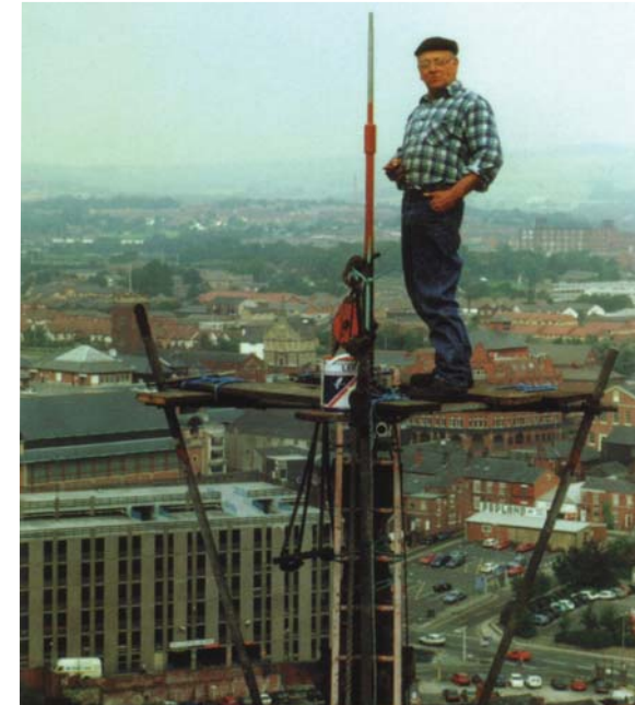
A respected & competent person from the past (you may recognise him?)

Now - we have to consider so much more, e.g: Competent Person & Formal Training; Guardrails & Toeboards; PPE; Safety Harness & fall arrest; Ladder secure and extending above the platform.