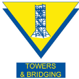
TOWERS & BRIDGING