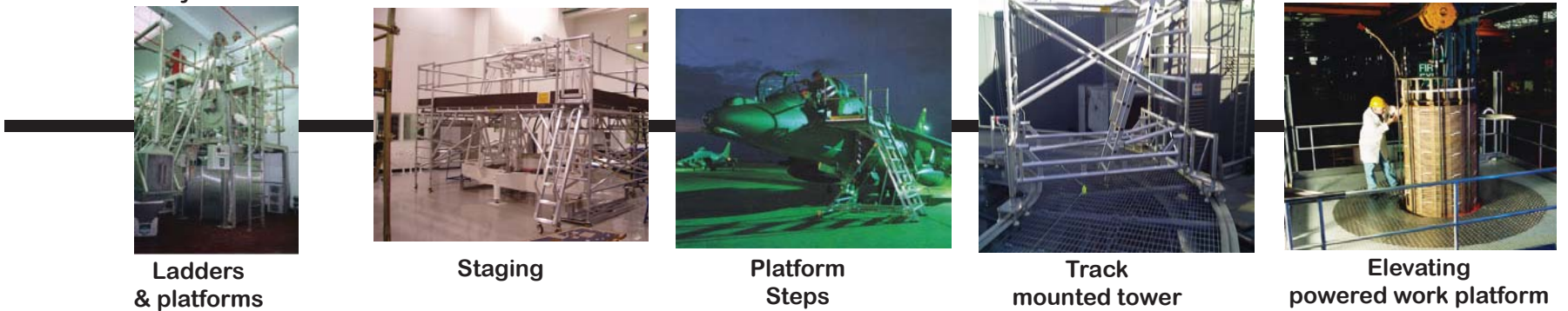
Ladders & platforms