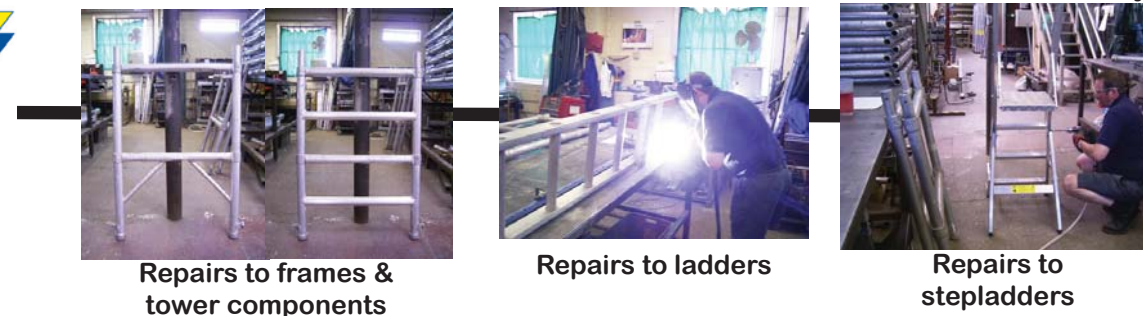
Repairs to frames & tower components