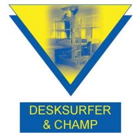
DEKSURFER & CHAMP