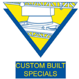
CUSTOM BUILT SPECIALS